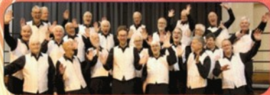
SHANNON EXPRESS CHORUS